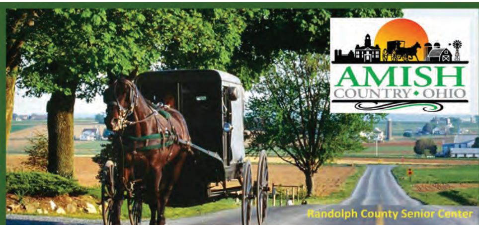
Randolph County Senior Center